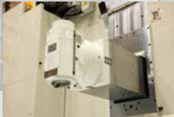
Long Angle Head